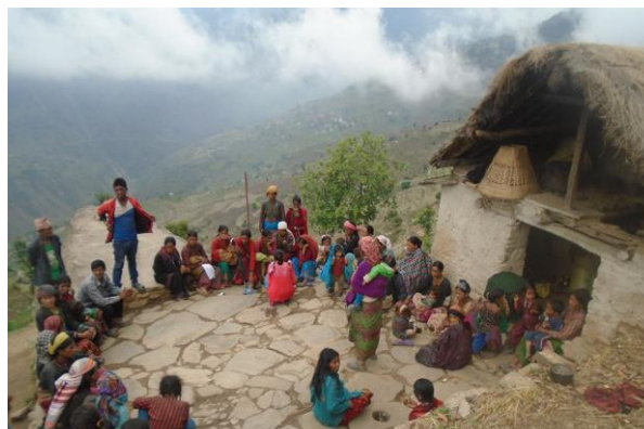
People gathered for discussion

and menstrual hygiene day have also taken place. The main idea of celebrating these days were linked with women's right to health and