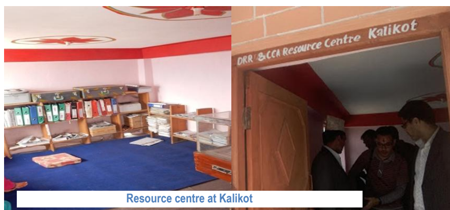
Resource centre at Kalikot

With the aim of strengthening organizational capacity and let to know the information related to DRR and CCA of Karnali and other region of world, KIRDARC established a regional resource centre for DRR and CCA at its