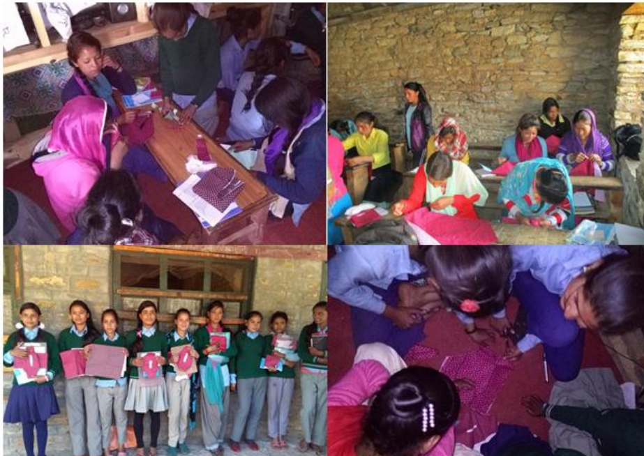
School girls preparing sanitary pad at Jumla

right to dignity. These are the issues which are deeply persisting in our communities. Thus in recent year, international concern for MHM, has focused on the need for dignity and privacy, on raising awareness to break the silence and stigma, making safe and effective MHM absorbents accessible, and improving the school environment.